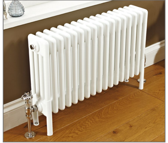
600 x 1010 Image Shown

Range: Radiators Type: Nicole 4 Column Code: RA413 Version/Date: v3 01/19