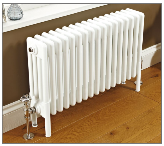
600 x 1010 Image Shown