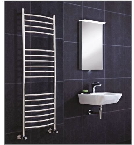
1500 x 500 Image Shown