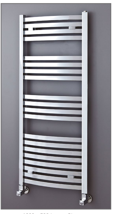
1200 x 500 Image Shown