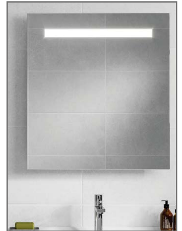
W60 x H70 Shown