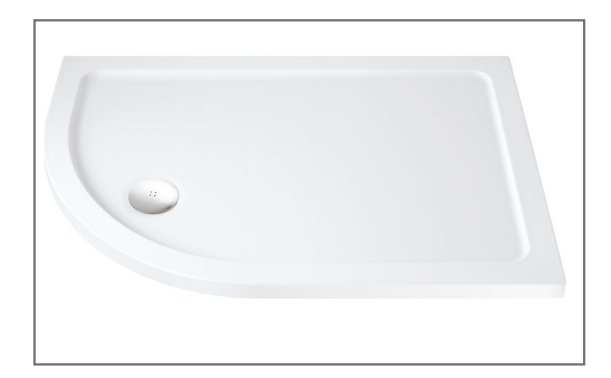
Dimensions in CM LP40R is reflected.