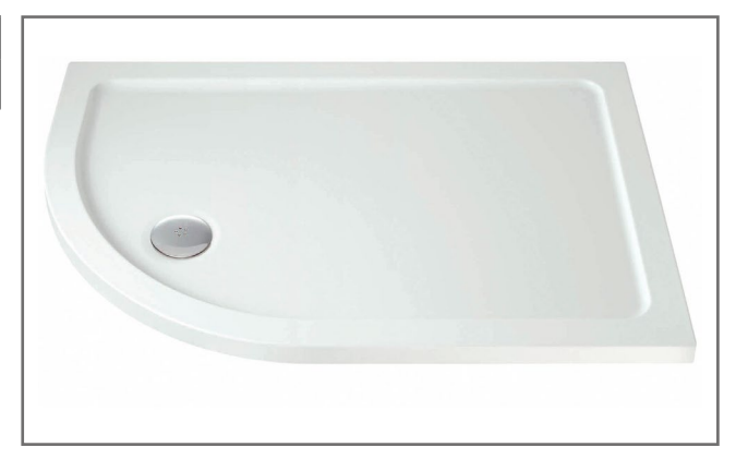
LP24R is reflected