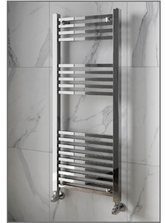
1500 x 500 Image Shown

This product is designed as a warmer of dry towels. Placing wet towels or garments on this product may result in the deterioration of the surface finish.